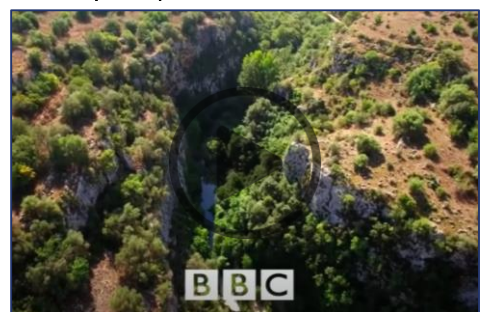
The wonder of the Mediterr. 1