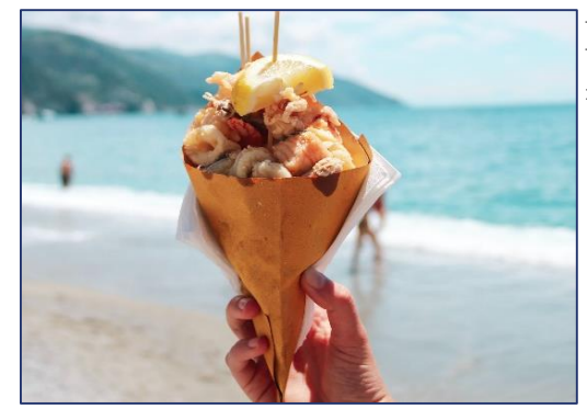
Unique things to experience

A <u>granita</u>, a sort of ice cream to be eaten together with a <u>brioche</u>. We do suggest the following flavors: pistachios, mulberry (gelsi), or coffee and almond.