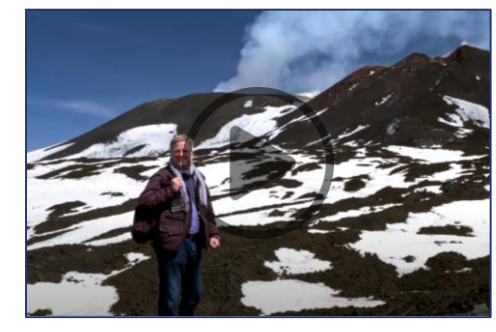
The best of Sicily