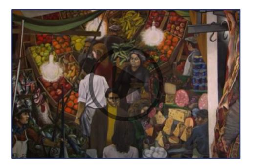
Sicily Unpacked 1 - Palermo