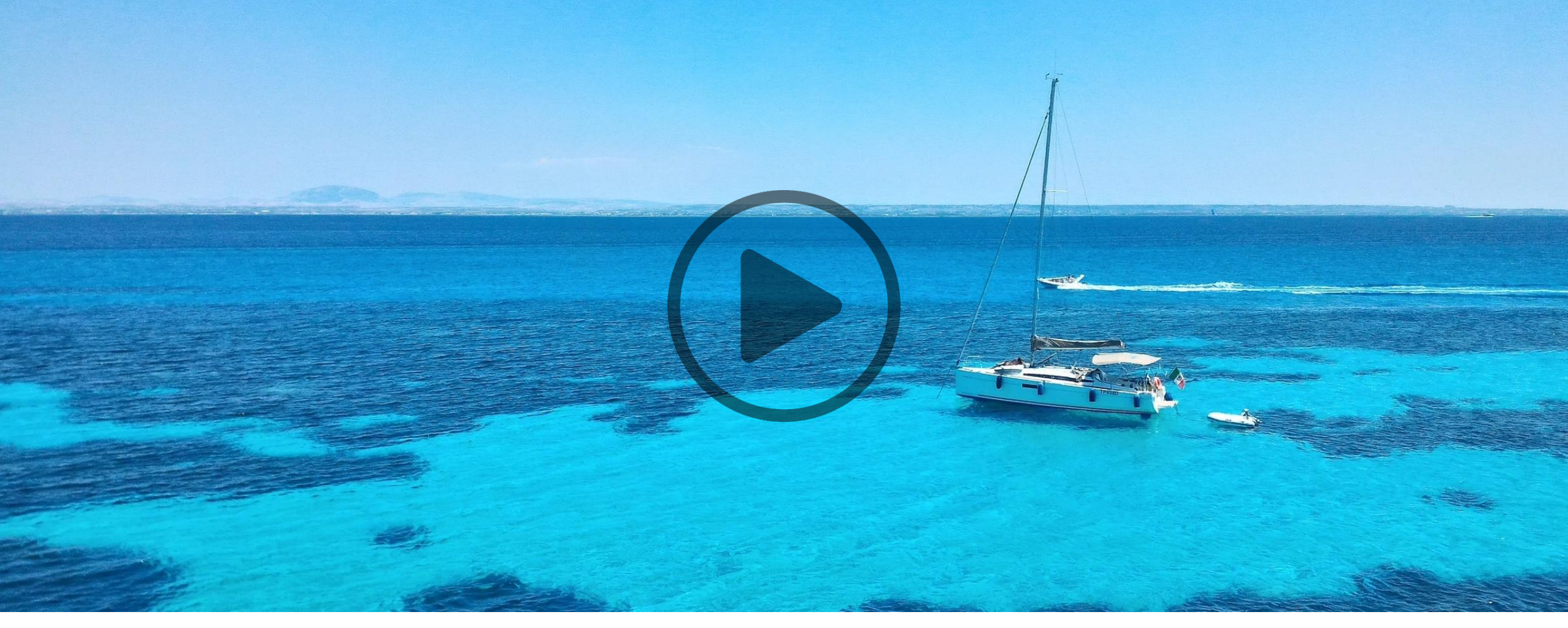
"To have seen Italy without having seen Sicily is to not have seen Italy at all, for Sicily is the clue to everything."