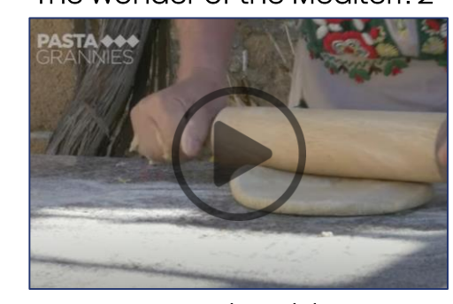
Pasta Grannies: Fish pasta